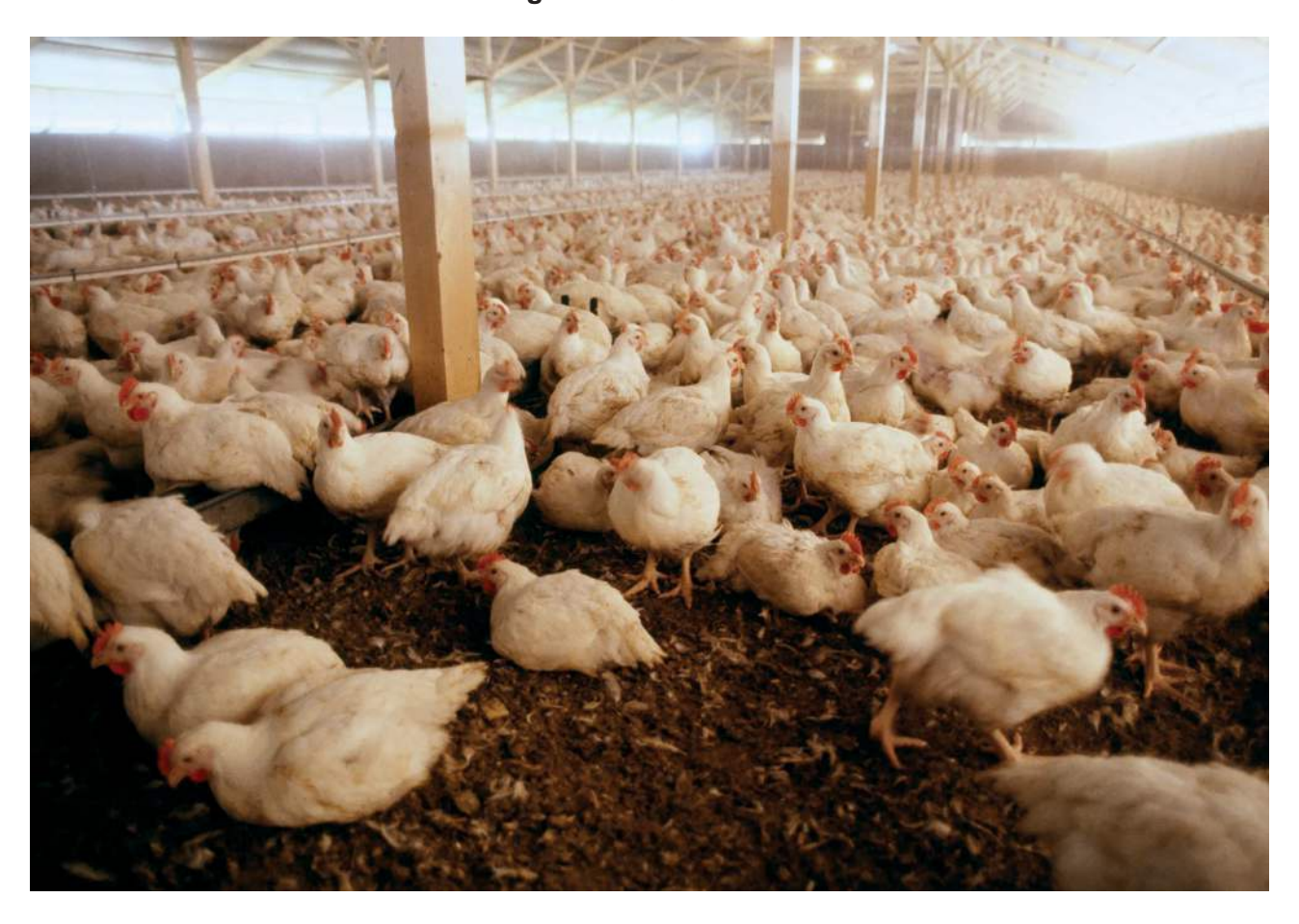
Fig. 5.1 for Question 5